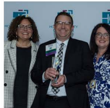
AMBASSADOR OF THE YEAR