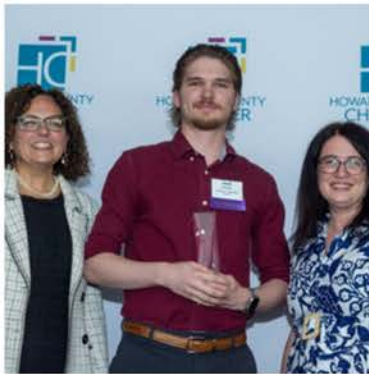
SMALL BUSINESS OF THE YEAR