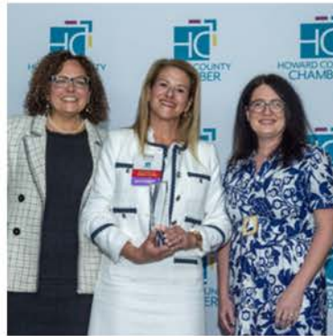
BUSINESS PERSON OF THE YEAR