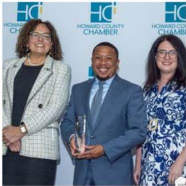
LARGE BUSINESS OF THE YEAR

THE AWARDS FOR CHAMBER EXCELLENCE HONOR OUTSTANDING LEADERSHIP, INNOVATION, AND IMPACT WITHIN THE HOWARD COUNTY BUSINESS COMMUNITY.