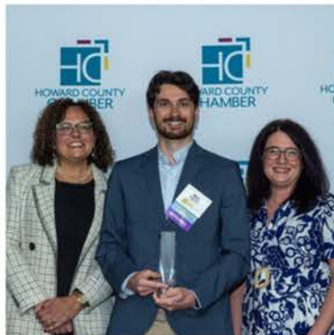
YOUNG PROFESSIONAL OF THE YEAR

Community Action Council of Howard County