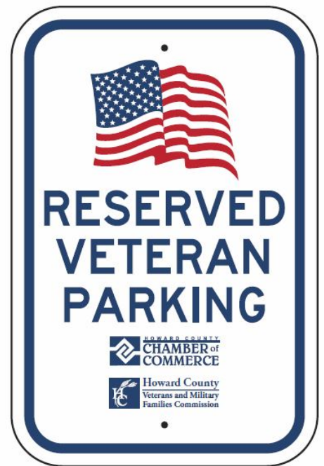
Image360 and Howard County Office of Military Affairs is pleased to offer discounted pricing for this worthy project.